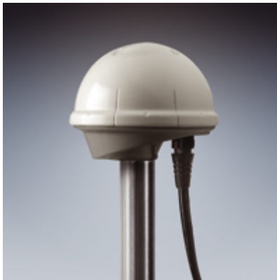
The Acutime Gold is the premier time source for synchronization of wireless networks.